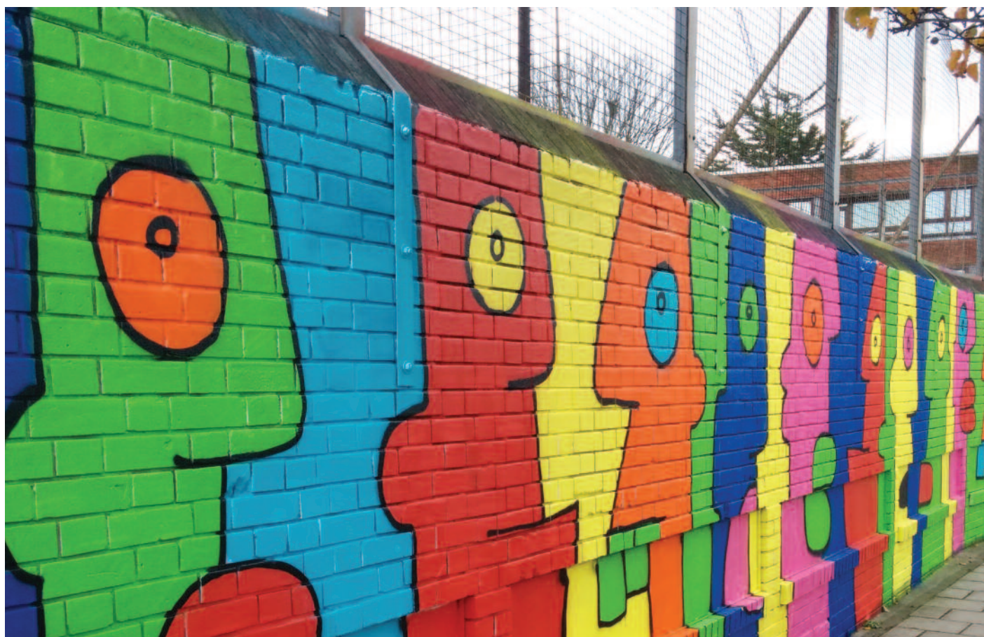
Thierry Noir street art

Ensuring that everyone has access to a high quality cultural offer regardless of their background, knowledge, skills, needs or experience. We need to work with partners in an unprecedented co-operative approach to address both real and perceived barriers to participation to drive higher engagement.