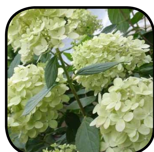
Hydrangea paniculata 'Limelight'