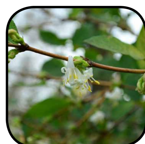
Lonicera x purpusii 'Winter Beauty'