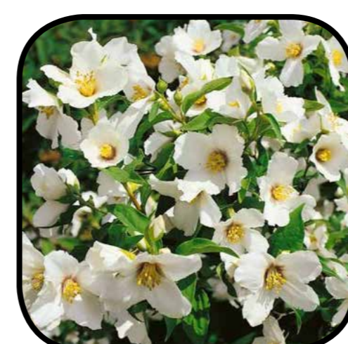
Philadelphus 'Belle Etoile'