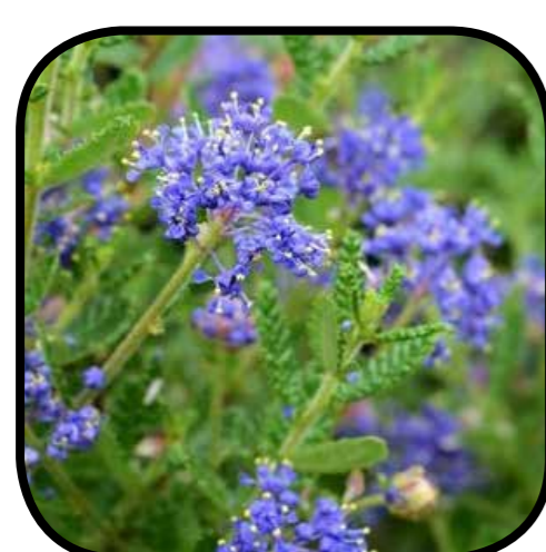
Ceanothus 'Puget Blue'