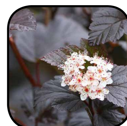
Physocarpus opulifolius 'Diabolo'