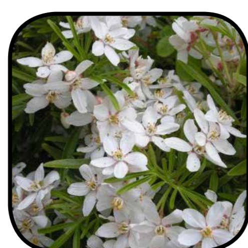
Choisya x dewitteana