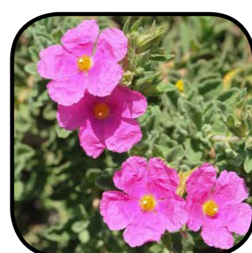
Cistus x pulverulentus