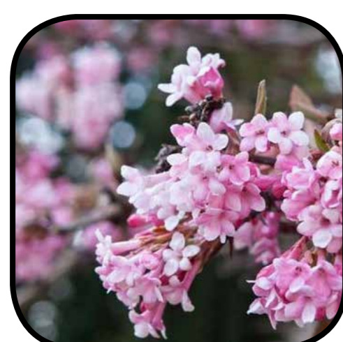
Viburnum x bodnantense