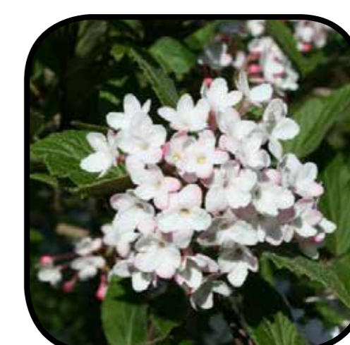
Viburnum x burkwoodii