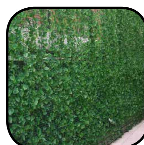
Climbers on fencing