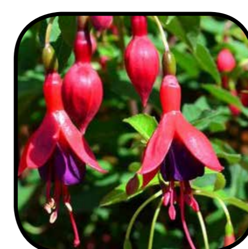
Fuschia 'Mrs Popple'