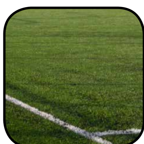
3G Astro Turf