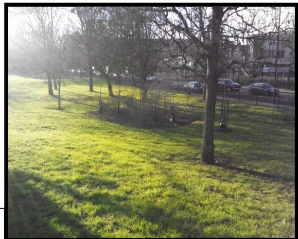
Burgess park on a sunny winters day