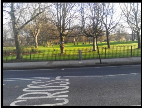
Burgess Park and Albany Road

not less. Make these public open spaces not private open spaces. Create green, walking and cycling links between open spaces (new and existing) and design these links, as well as the new parks; so that they are pleasant leisure spaces, with seating, art, planting, things to do such as sports, outdoor gyms, and play spaces. More trees. Try to make better use of the green spaces on estates, and try pop up parks too. Create community gardens and allotments, bandstands and cafes. Make sure these spaces feel safe, e.g. lighting. Fund more festivals in local parks