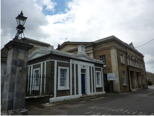
The gate-house to the side of the open space, fronting Asylum Road