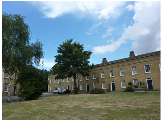
The dwellings to the rear, fronting the open space at the back of the horse-shoe