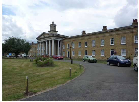
The Chapel at the centre of the composition, fronting the open space