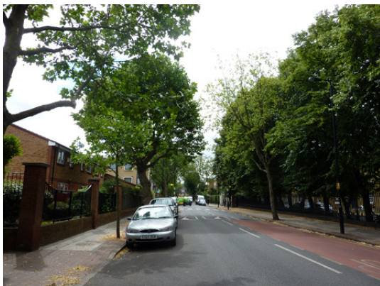
The leafy character of Asylum Road

3.6.3. Asylum Road itself, particularly in the immediate context of Caroline Gardens, has a pleasant townscape quality. There are a number of attractive early and mid-Victorian buildings including the neighbouring listed early 19 th Century semi-detached villas, the Queen Elizabeth Public House on the corner of Asylum Road and Gervase Street and the converted school to the south east of the almshouses. However, not being part of the formal, self-contained almshouse layout, they have not been included in the designated conservation area.