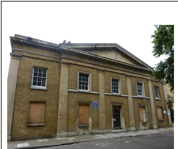
Boarded windows in the North Lodge