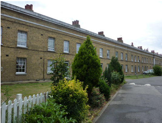
The dwellings to the side of the main horse-shoe composition