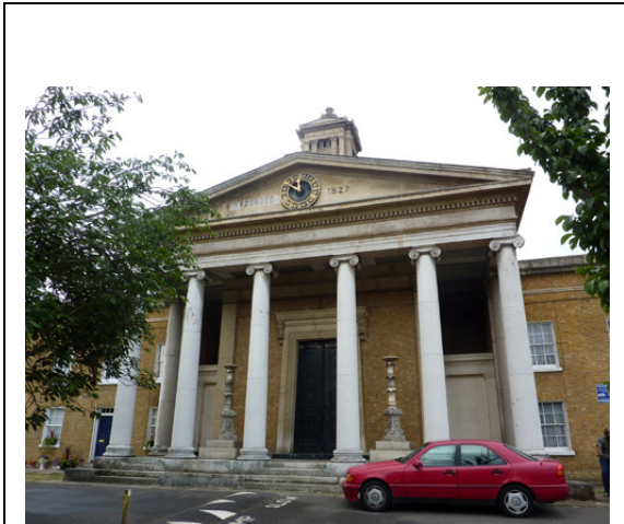
Parked areas are very visually obtrusive

3.8.7. The accommodation of the car has been carried out insensitively and has caused harm in a number of ways. Wide tarmac driveways that can accommodate two cars passing as well as parking in some instances dominate the grounds. This is not only unsightly but must surely discourage residents from using many parts of the grounds. Parking signs have also been prominently positioned on buildings to their detriment. There would appear to be potential to re-position these off the buildings and onto lamp posts, which are well dispersed.