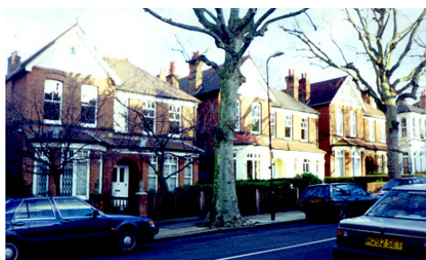
Figure 8 Edwardian detailing