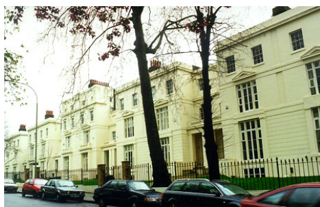
Figure 5 200-218 Camberwell Grove – recently renovated