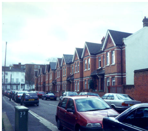
Figure 7 Edwardian housing, Champion Grove