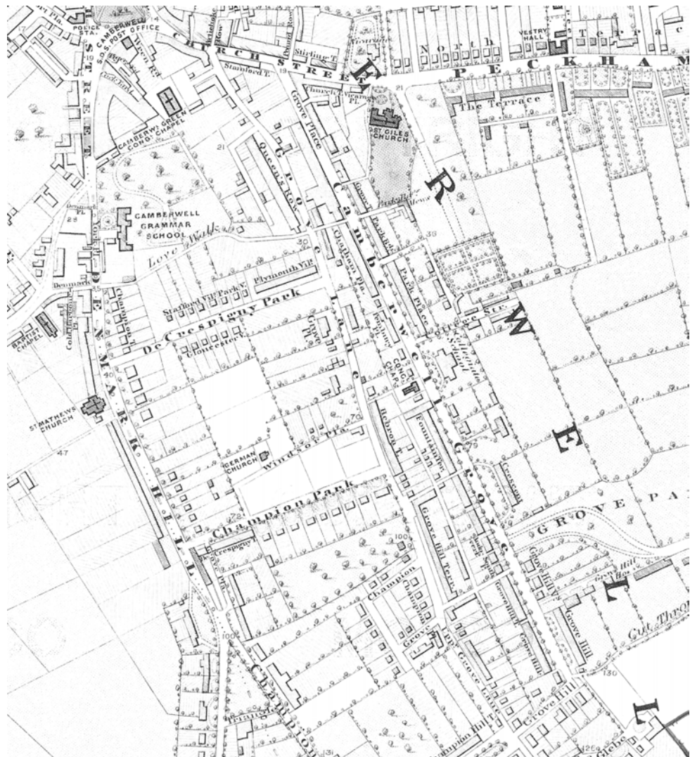
Figure 3 Edward Stanford's map prepared in the 1860s