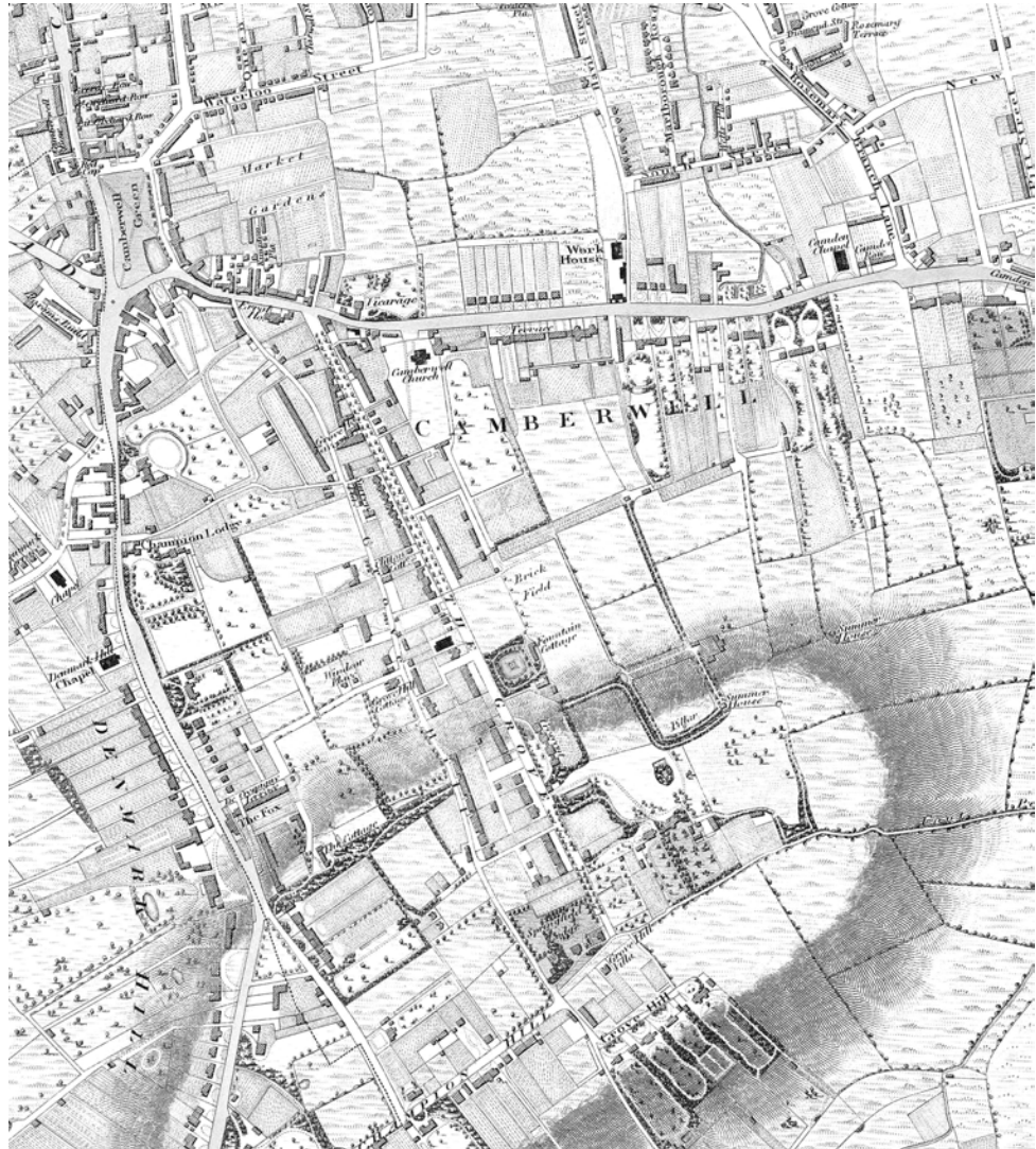
Figure 2 Greenwood's map of London and suburbs, 1830, showing Camberwell Grove as a tree-lined avenue "The Grove", and the earliest houses in Grove Park.