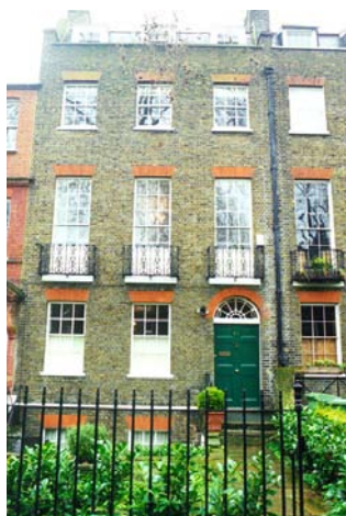
Figure 6 91 Camberwell Grove – typical late 18 th century classical proportions – tall proportions to the first floor and reduced window heights at upper levels.