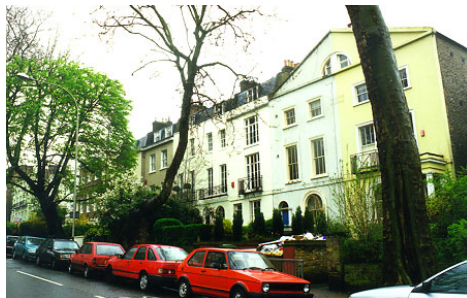
Figure 46 Variety and consistency in Camberwell Grove