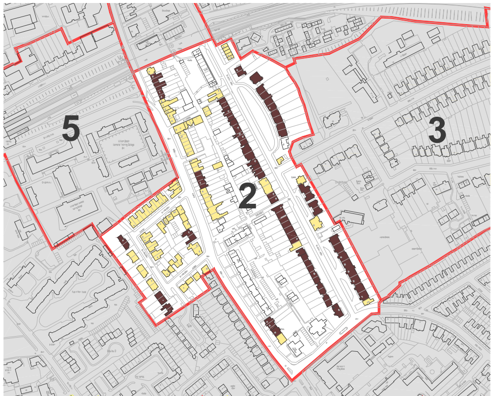
Figure 47 Sub-area 2: Listed buildings (red) and key unlisted buildings