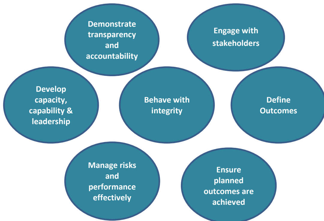
Table 1 – Core principles of the CIPFA/SoLACE framework

2.1 The CIPFA/SoLACE Delivering Good Governance publication (2016) defines the various principles of good governance in the public sector. The document sets out seven core principles that underpin the governance framework and these are set out in Table 1 below