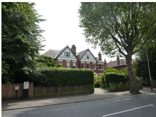
Typical dwellings in the Conservation Area along Half Moon Lane

2.2.4. The present road layout was put down after the estate building works had commenced. The original intention was for Winterbrook Road to run in an east west alignment between the site of 9 and 11 Burbage Road to 20, Stradella Road.