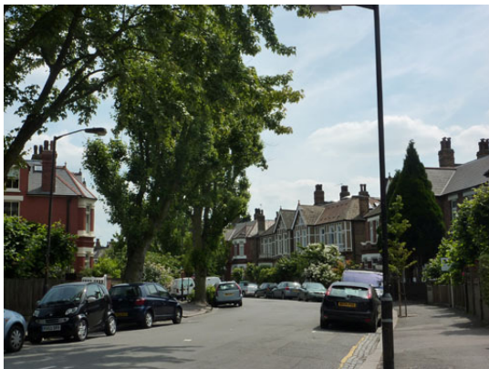
Mature and newly planted trees lining Stradella Road on both sides