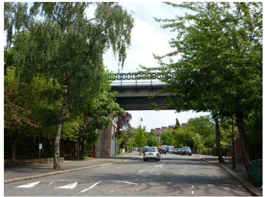
Unobtrusive traffic calming on Burbage Road