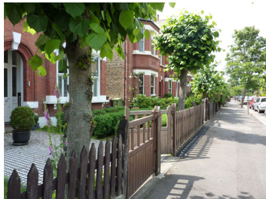
Oak fences enclosing the front garden area of the dwellings