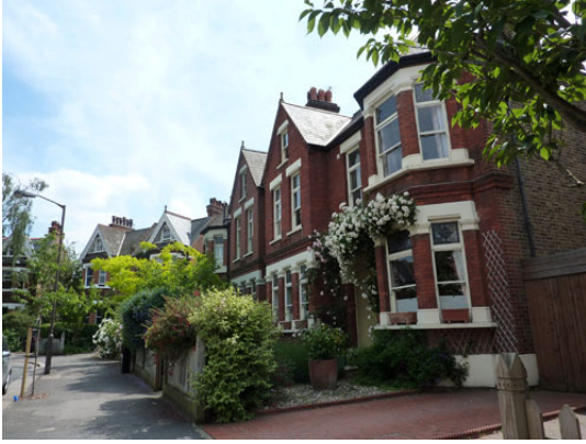
Typical dwellings along Stradella Road