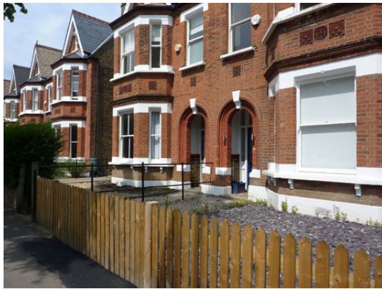
Front garden spaces with the footpaths in the original mosaic paving, but now hard-landscaped