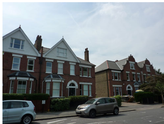
Typical dwellings in the Conservation Area along Burbage Road