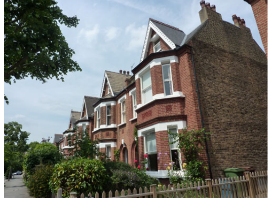
Typical dwellings along Winterbrook Road