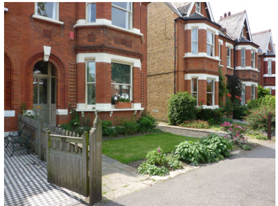
Removal of fences, leading to lack of delineation of the pavement (Winterbrook Road)