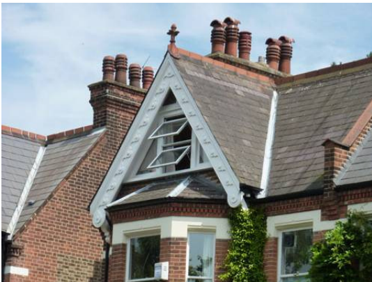
UPVC windows in the gable (Stradella Road)