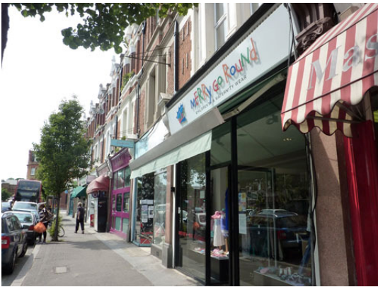
The parade of shops on Half Moon Lane