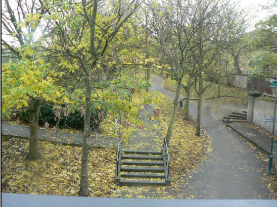
Former Surrey Canal