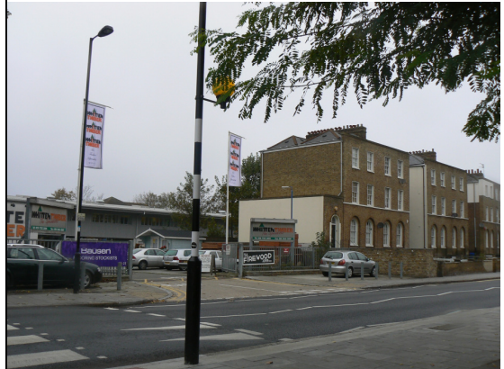
Whitten Timber Yard