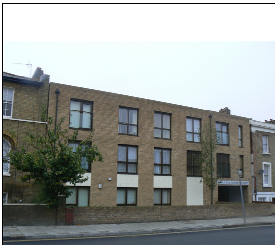
No. 32 Peckham Hill Street

4.5.2 Opportunities exist within the conservation area for removal of inappropriate modern alterations such as: UPVC windows and modern doors. Consideration should also be given to the relocation of satellite dishes to the rear or roofline.