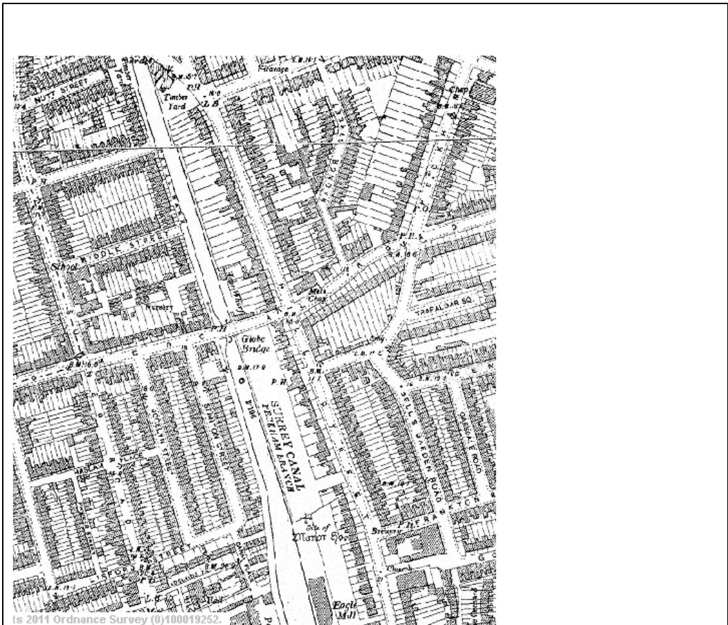
Peckham Hill Street c.1896