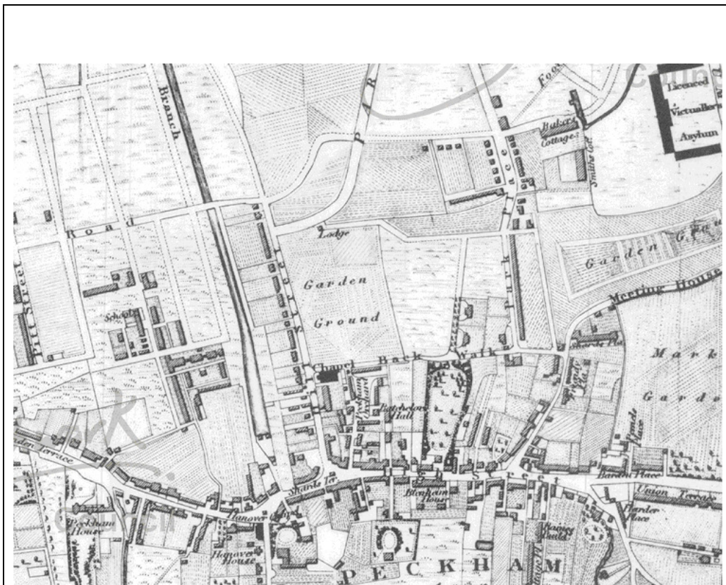
Peckham Hill Street c.1830

1.8.2 Information on the Southwark Plan, including electronic versions of the plan and supplementary planning guidance, can be found on the Council's web site at www.southwark.gov.uk .