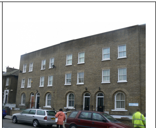
St. George's Terrace