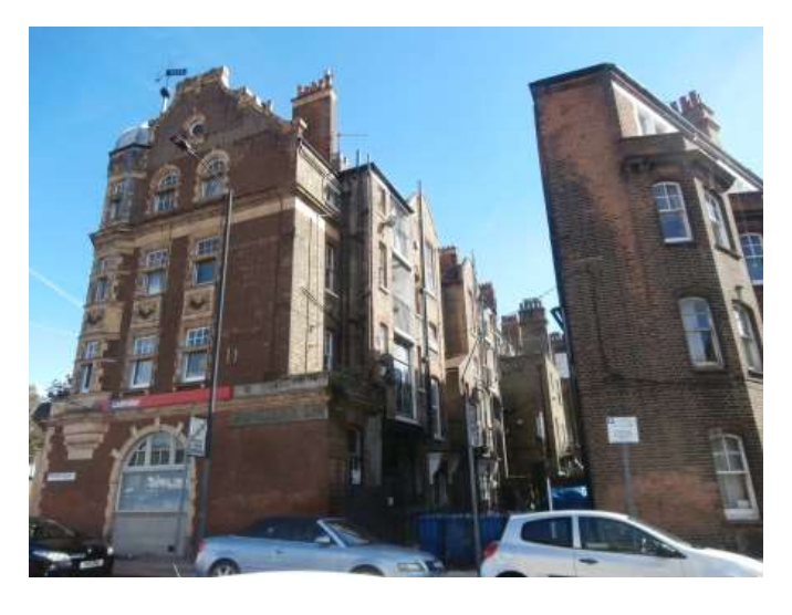
Figure 5 Royal London Friendly Society (RLFS), side view