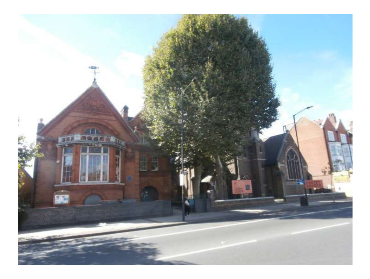
Figure 11 Livesey Museum (former Camberwell Library)