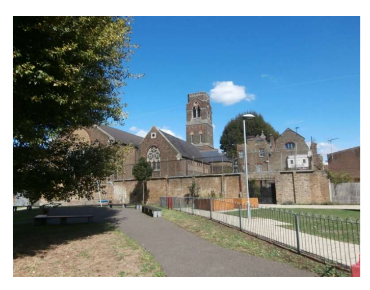
Figure 14 Christ Church and Livesey Museum from open space at Pencraig Way