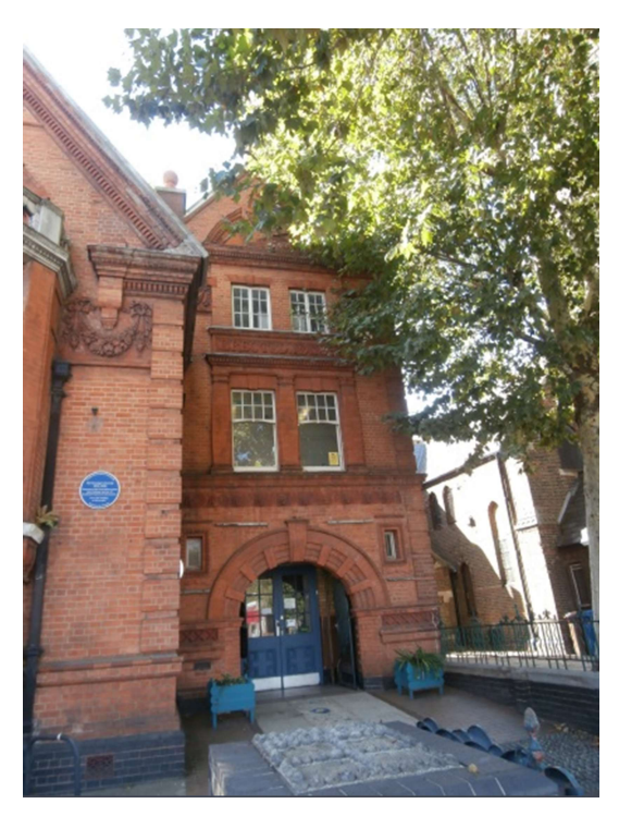
Figure 12 Livesey Museum (former Camberwell Library)