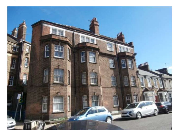
Figure 6 Royal London Friendly Society (RLFS), rear