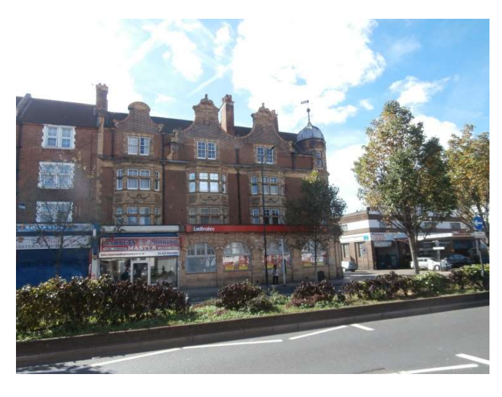
Figure 3 Nos 644–648 Old Kent Road, Royal London Friendly Society