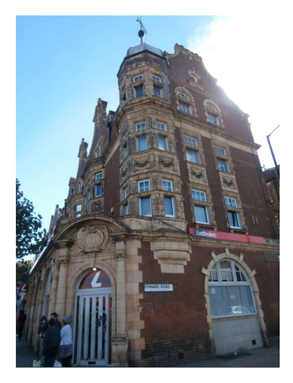
Figure 4 Royal London Friendly Society (RLFS), Corner of Old Kent Road and Ethnard Road