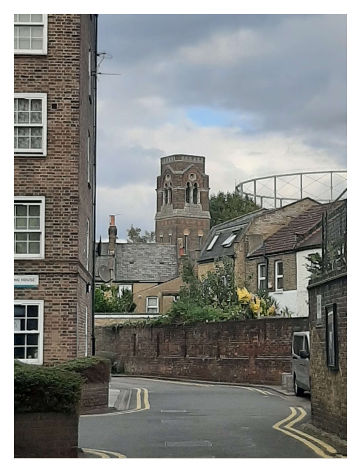
Figure 13 Back street views of Christ Church and a remaining gasholder on the former Gasworks site

3.2.30 Although not historic, the present rather larger space is a pleasant one that affords interesting views towards the picturesque rear façades of the Livesey Museum and Christ Church and into the backs of Nos 650–672. It is worthy of inclusion within the Conservation Area for this reason. It is the location of a children's play area.