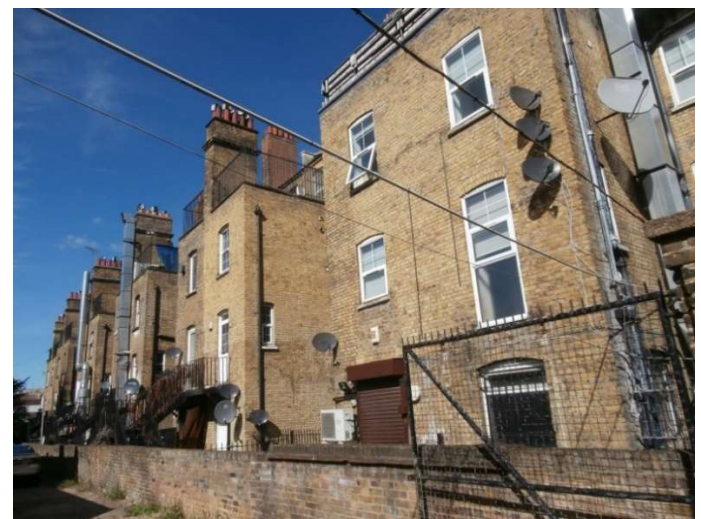
Figure 7 Nos 650-672 Old Kent Road