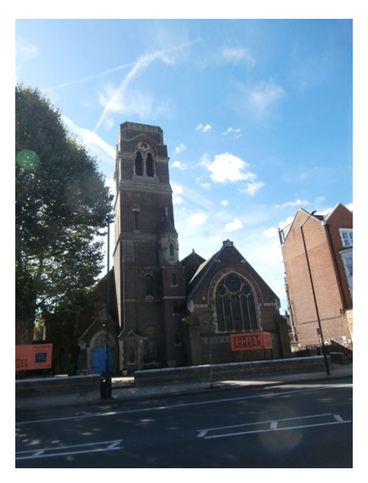
Figure 10 Christ Church, Old Kent Road