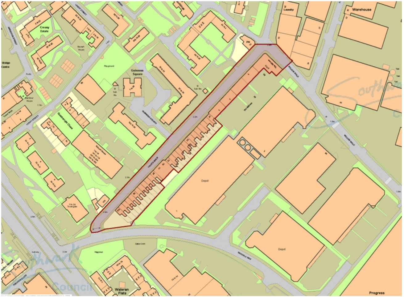
Page's Walk Conservation Area