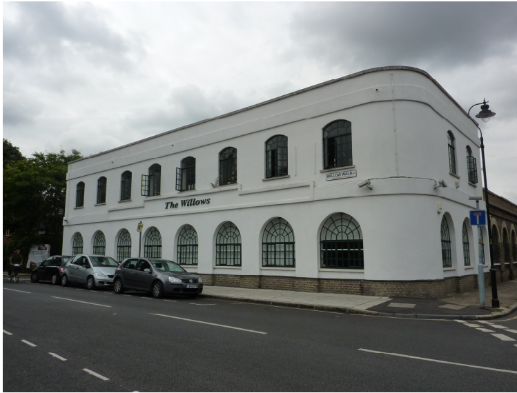
Nos. 1-8 Willow Walk (Willow Walk elevation)

2.1.5 The Bricklayer's Arms Railway Station was constructed around 1843 and was the first station to be controlled by a signal box. After some use, it fell into redundancy as a passenger station and in 1852 its passenger services were transferred to London Bridge. The railway station retained its functions as a goods station with the attendant train sheds, wagon houses and stables occupying much of the land to the east of the conservation area.