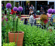
New REPA cafe