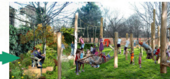
Proposed boundary after REPA location