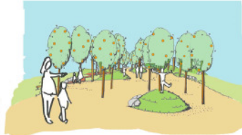
Avenue with natural play