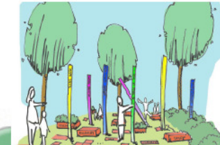
Entrance from Harper Road