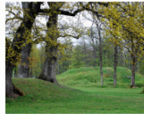
Mounding and "village green"