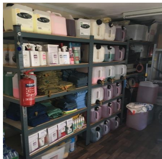
Compliant chemical storage