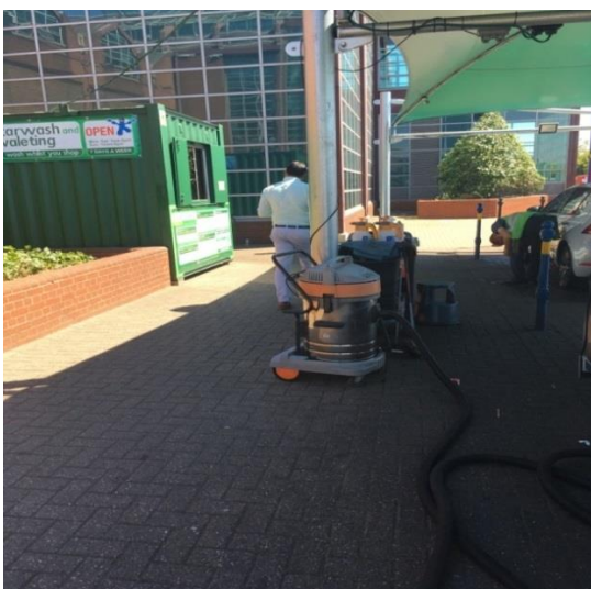
Safe electrical appliances & installations