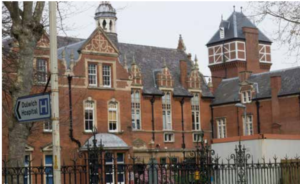
Dulwich Hospital

Completed in 1915, the hospital built by Henry Maudsley didn't even have the chance to serve its intended patients before it was taken over by the government for the WWI effort. In 1923, it was returned back to public use for those suffering with neuroses and mild forms of psychosis. By 1933 it had the largest outpatient department for mental health in the UK. After WWII the hospital joined the NHS, eventually becoming the South London and Maudsley Trust.