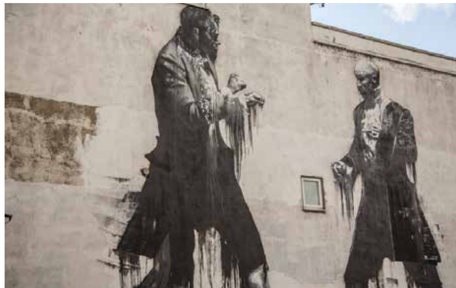
Duelling Boxers Mural, photograph by Uschi Klein

The Duelling Men by Irish artist Conor Harrington was created for 'Baroque the Streets' – Dulwich's Street Art Festival in 2013.