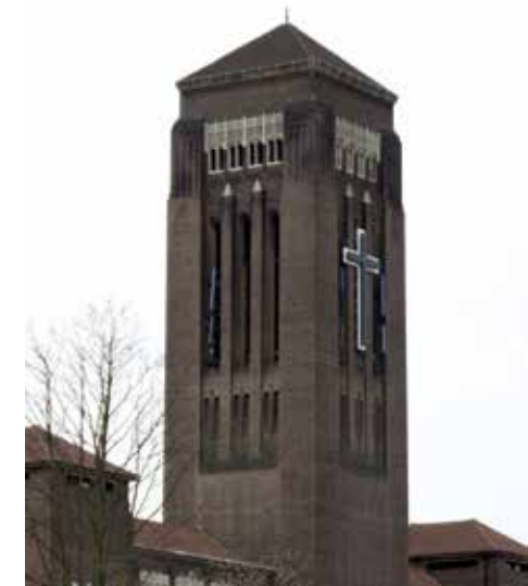
Booth Hall