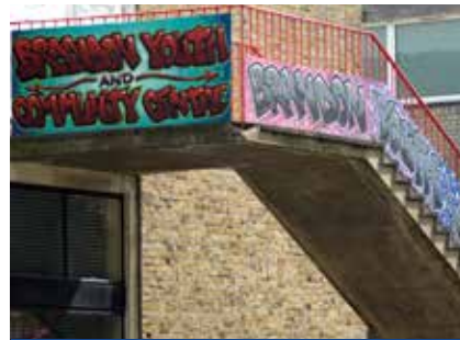
The Brandon Estate

1 Brandon Estate Brandon is a triangular area bounded by the railway line to the east and two major roads: Kennington Park and Camberwell New Road. The tower blocks that dominate it today were developed in the 1960s, and have been featured in the 2005 series of Doctor Who .