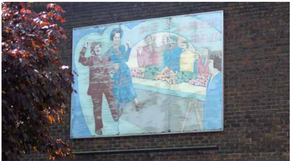
Lambeth Walk