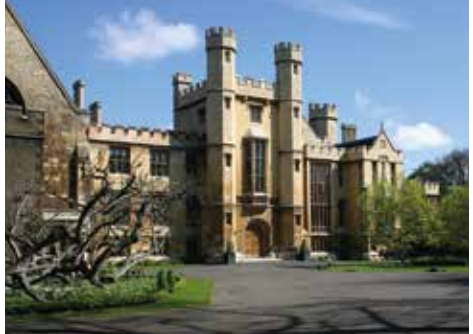
Lambeth Palace

8 Lambeth Palace This is an opportunity to look over the River Thames towards the Houses of Parliament and consider one of the most dangerous acts of rebellion in the history of Great Britain: the gunpowder plot. On November 5th 1605, a plot to assassinate King James I and members of parliament was uncovered. Led by Robert Catesby, a dozen conspirators had planned an uprising to put