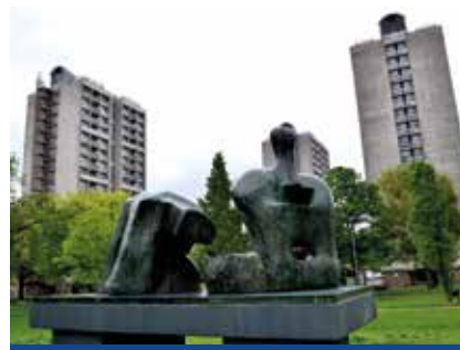
Henry Moore Sculpture, Brandon Estate

1948 was known throughout Europe as the Year of Revolutions, and this was the site of the greatest demonstration in the UK. On April 10th around 150,000 people gathered in support of the working-class Chartist movement, which campaigned for political reform. The rally was the culmination of a decade of agitation. From Kennington a third and final petition was processed to Parliament. Although the meeting was peaceful, previous violent encounters meant an additional 100,000 special constables were recruited to maintain order. In the end, the government undermined the Chartists' credibility by stating only a third of the estimated six million signatures were genuine. The movement eventually lost impetus after measures brought in by parliament to ban public meetings and planned insurrections removed the key leaders.