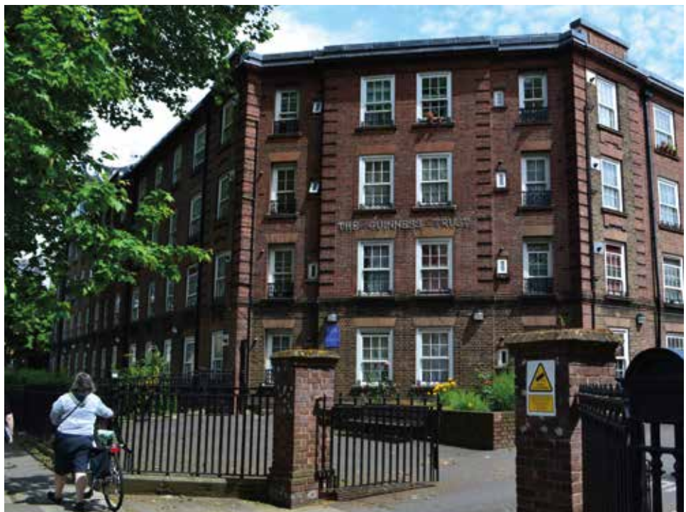
Guinness Trust Flats

7 Geraldine Mary Harmsworth Park – St. George’s Fields and Berlin Wall A large area of land just past the north edge of the park used to be known as St. George’s Fields; quite marshy and poor to build on but close to London, it was the site of Southwark Fair in the 1700s, and some of the most dramatic political demonstrations of the age. The most serious were the anti-Catholic Gordon Riots in 1780, when around 40,000