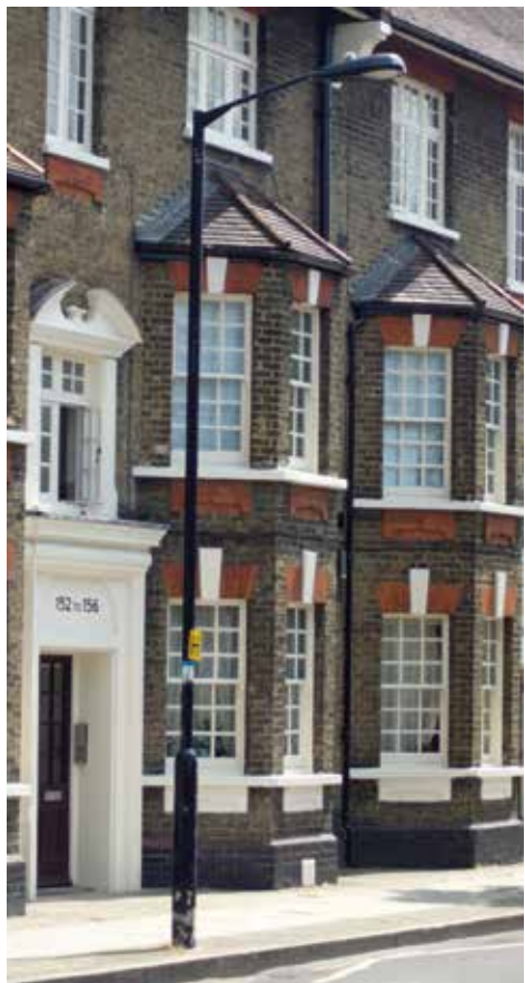
Octavia Hill Houses, Portland Street, photograph by Robert Larkin-Frost

When the bombs detonated, the entire building jumped into the air and re-settled onto its foundations with surprisingly little damage.