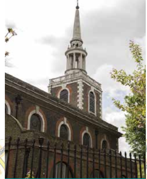
St Peter's Church

Then tragedy struck; three high explosive bombs came straight through the building and exploded in the packed crypt. At least 100 people were killed immediately and many more were seriously injured. In fact it was a miracle that the floor of the church did not collapse as well. When the church was inspected by engineers the reason for this became clear - the arches continued below ground to form a complete circle of brickwork.