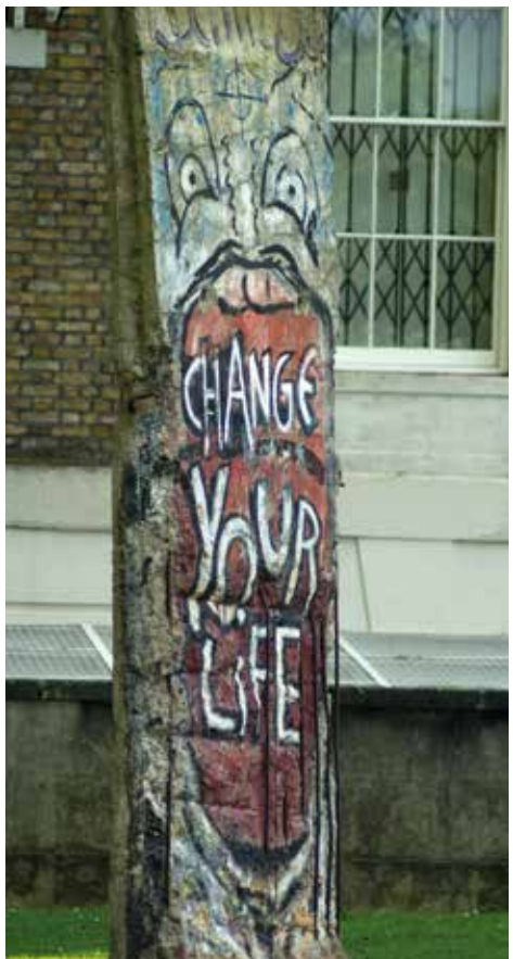
Imperial War Museum Berlin Wall

8 St. George’s Fields – Checkpoint Charles I During the English Civil War of 1642-1651, King Charles I fled the capital, leaving it to his opponents, the Parliamentarians. In