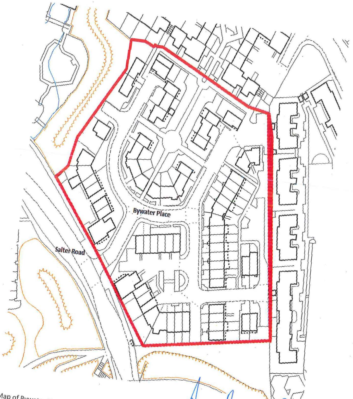
Map of Bywater Place, Surrey Quays, London SE16 (DO NOT SCALE)