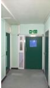
(HSA)PHAU03680201-FRA-SITE-3-1-1-4-1-0-218 - Copy.jpg