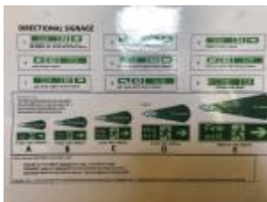
X-Fire exit signage 2018008.jpg