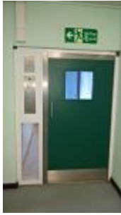
(HSA)PHAU03680201-FRA-SITE-3-1-1-4-1-0-151 - Copy.jpg