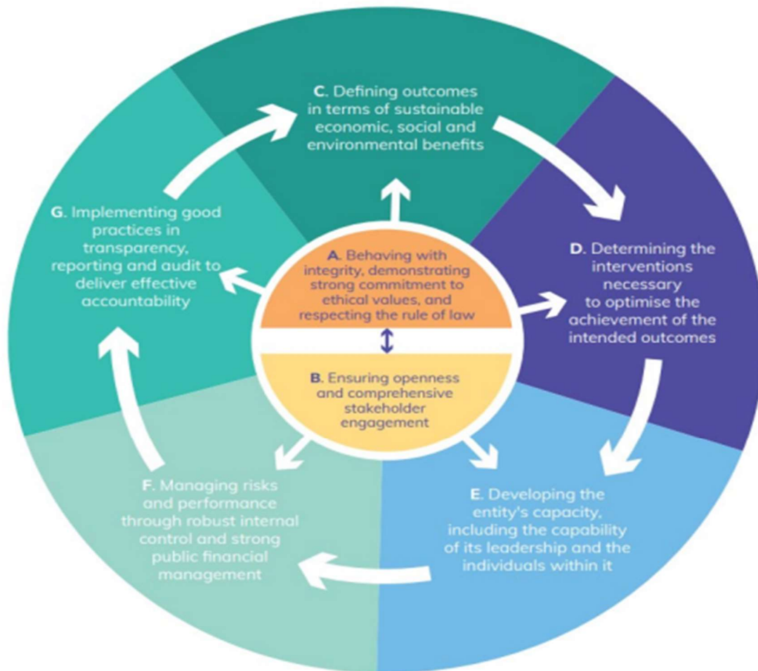
Figure 1: Establishing an effective assurance framework

3.4 For good governance to function well, the CIPFA Advisory Note highlighted the need for organisations to encourage and facilitate a high level of robust challenge. The Corporate Peer Challenge undertaken in October 2023, enabled leaders and members to have an external assurance of the governance arrangements in place. The recommendations and action plan arising from the review has provided a welcome steer to enhance and strengthen those arrangements.